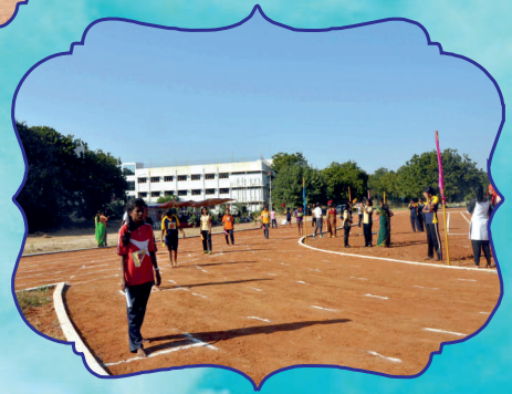
200 mts Track