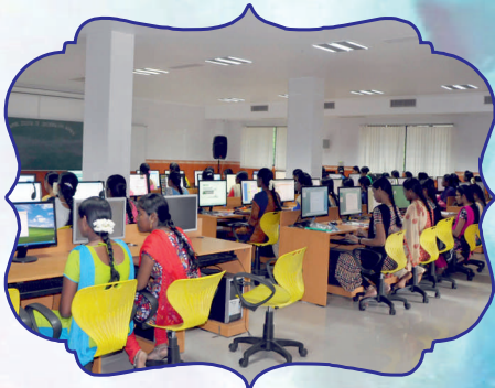
NETWORK RESOURCE CENTRE