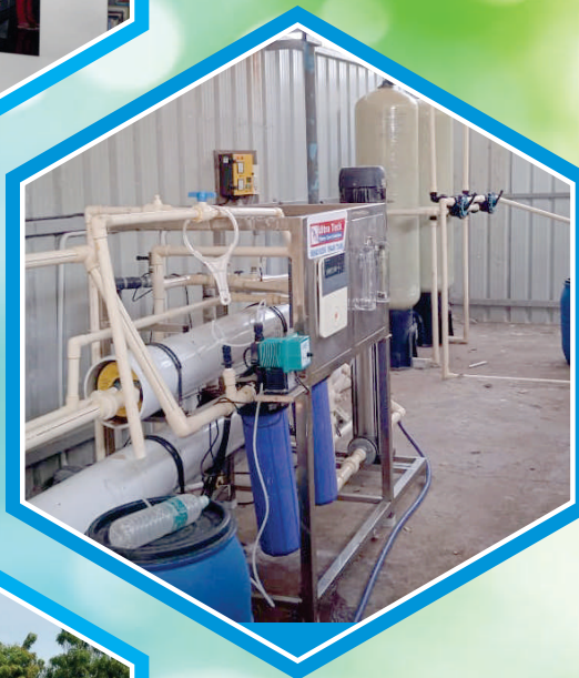
RO WATER FACILITY IN THE CAMPUS