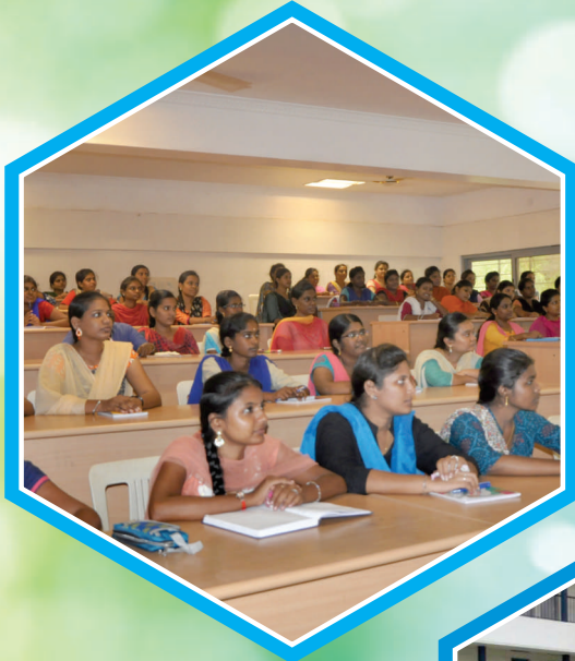
GALLERIED CLASS ROOM