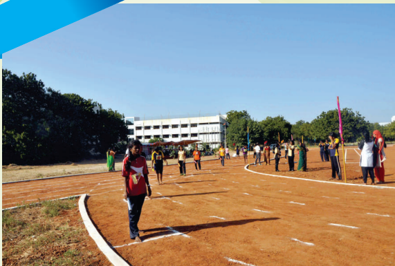
200 mts Track