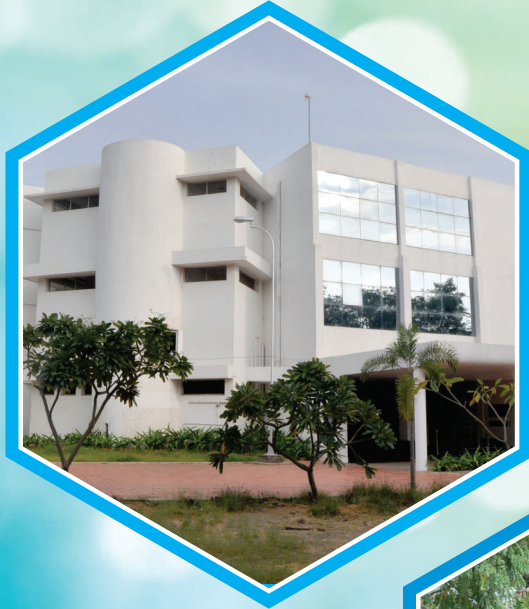
FRONT VIEW OF THE COLLEGE