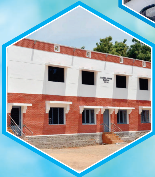
DAY CARE CENTRE