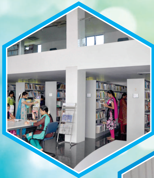
AIR CONDITIONED LIBRARY WITH MEZZANINE FLOOR