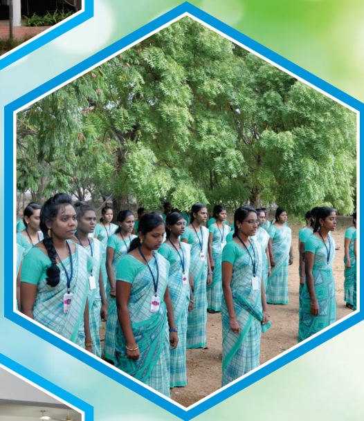
STUDENTS IN UNIFORM