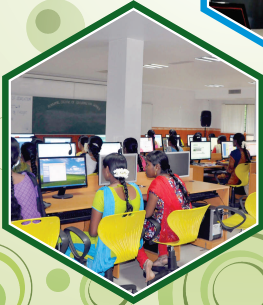
NETWORK RESOURCE CENTRE